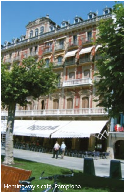
Hemingway's café, Pamplona