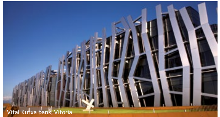
Vital Kutxa bank, Vitoria

lack of vehicles in the city centre makes this a relaxing place, although it's lively and has a great atmosphere particularly in the evening. While you're here why not try a glass or two of txakoli, the effervescent Basque wine, accompanied by some of the delicious pintxo (tapas) which are excellent here. As well as museums and art galleries Vitoria has 2 beautiful cathedrals - the unmissable Santa Maria dating from the 13th century and in complete contrast the other, known as the new one, originated just over 100 years ago and is still unfinished. There is also some striking modern architecture in the city.