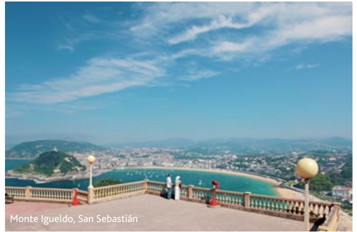
Monte Igueldo, San Sebastián

Also known as Donostia, this is a stylish, beautiful city built around a bay with fantastic sandy beaches, fine architecture and an endless choice of places to enjoy some of the best cuisine in the world. Some of the greatest views of the city can be seen from Monte Igueldo, reached in 3 minutes by funicular (an experience in itself) or on foot taking the road and a few shortcuts up some steps every so often. There's also an old fashioned funfair at the top.