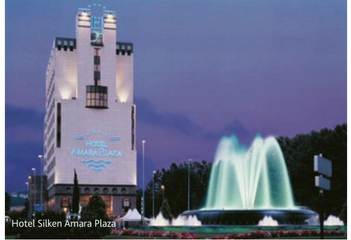
Hotel Silken Amara Plaza

Also known as Donostia, this is a stylish, beautiful city built around a bay with fantastic sandy beaches, fine architecture and an endless choice of places to enjoy some of the best cuisine in the world. Some of the greatest views of the city can be seen from Monte Igueldo, reached in 3 minutes by funicular (an experience in itself) or on foot