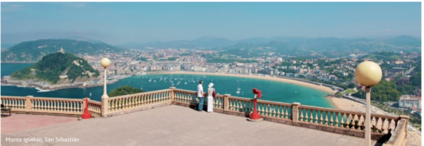
Monte Igueldo, San Sebastián

taking the road and a few shortcuts up some steps every so often. There's also an old fashioned funfair at the top. La Concha beach is the top attraction in the city which crowds of people head for in summer to cool off, relax, sunbathe, swim or surf. Another part of the city not to be missed is the Parte Viejo, a network of streets filled to the brim with bars, restaurants, cafés and pintxo bars (the Basque equivalent of very delicious tapas) - there's a great atmosphere here by day or night. San Sebastián is also famous for its many Michelin starred restaurants so you are really spoilt for choice when it comes to dining.