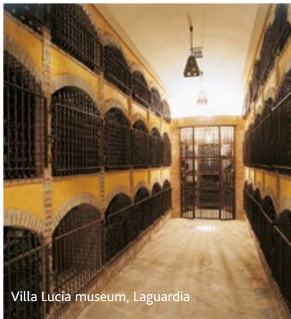
Villa Lucia museum, Laguardia

Driving from La Vid to Laguardia we suggest you take the route heading slightly to the east so that you have a chance to see one of Spain's undiscovered treasures, El Burgo de Osma. This small