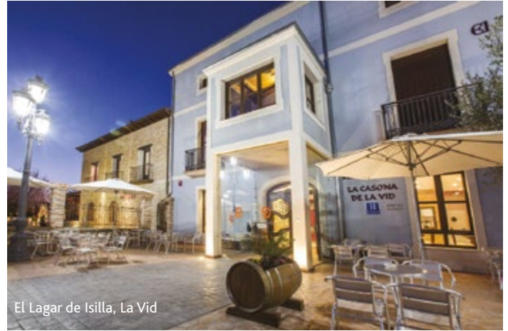
El Lagar de Isilla, La Vid

Heading south to La Vid from Santander you may like to stop for lunch at Burgos, the capital of the Castilla y León region. It has a particularly impressive cathedral which can be seen for miles around. The Ribera del Duero region enjoys a worldwide reputation for its high quality wines, in particular Tempranillo, from the most famous of Spain's native grapes which produces a rich purple colour. Your overnight stay at the charming boutique hotel El Lagar de Isilla may well be one of the highlights of your tour. It is part of a well renowned bodega where you can expect a friendly welcome and take a guided tour in English with tastings. You can of course also buy some wine to take home if you choose.