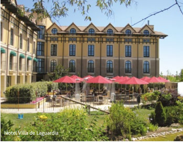
Hotel Villa de Laguardia

Driving from La Vid to Laguardia we suggest you take the route heading slightly to the east so that you have a chance to see one of Spain's undiscovered treasures, El Burgo de Osma. This small