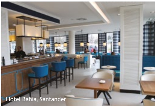
Hotel Bahia, Santander

Standing along the north shore of a great bay of stunning natural beauty, Santander is a sophisticated resort with much to offer. King Alfonso