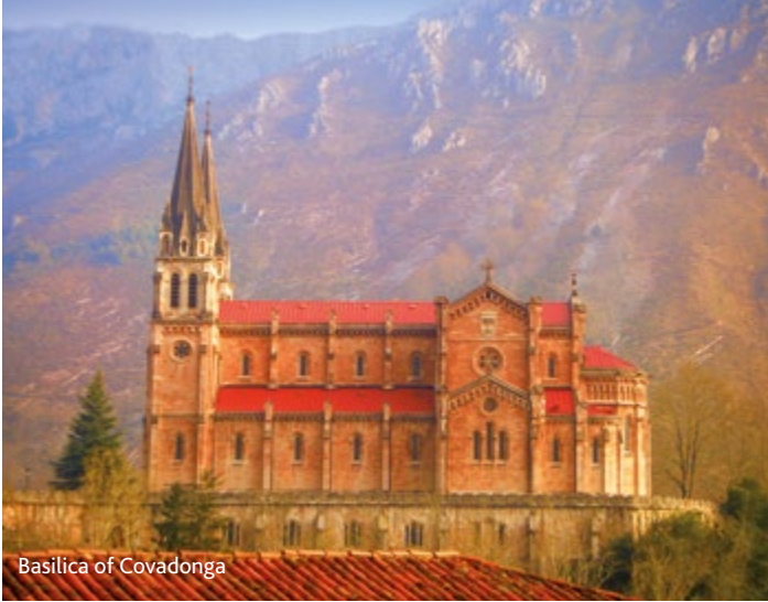
Basilica of Covadonga

The main attraction here is the Basilica of Santa Maria, which is an inspiring sight when you see your first glimpse of it from the road in its beautiful mountain setting - you can see why this is a stop off point for tourists.