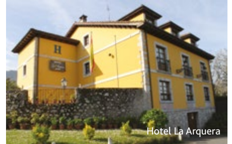
Hotel La Arquera