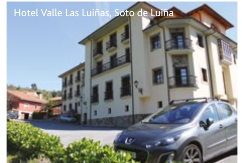
Hotel Valle Las Luiñas, Soto de Luiña

A pleasant village of terracotta tiled buildings set amongst green hills, Soto de Luiña is a peaceful place to stay, a short drive inland (or about 2k on foot) from a charming little beach. The colourful fishing village of Cudillero is 15 minutes away and is one of the many