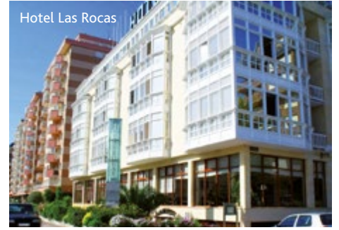
Hotel Las Rocas

Around 45 minutes' drive from Santander and even less from Bilbao, Castro Urdiales on the Bay of Biscay has grown from a little fishing port to a modern seaside town with several lovely beaches attracting lots of holidaymakers in summer. In a