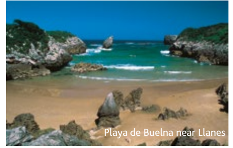
Playa de Buelna near Llanes

This is a busy summer holiday location with a choice of dozens of wonderful beaches and coves, the San Pedro clifftop walk (spectacular coastal views), colourful fishing harbour and plenty of seafood restaurants in and around the port. The most popular beach is the one in town, El Sablon, which is great for families with its fine sand and calm water, or for surfing and other watersports the ones at Andrin and Ballota are more suitable. If you're interested in local culture there are a number of fiestas in Llanes with folk dancing and townspeople in traditional dress.