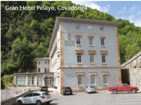
Gran Hotel Pelayo, Covadonga

9k northwest of Covadonga is another great centre for excursions into the mountains - the ancient town of Cangas de Onis , where there is a distinctive Roman bridge with 5 arches.