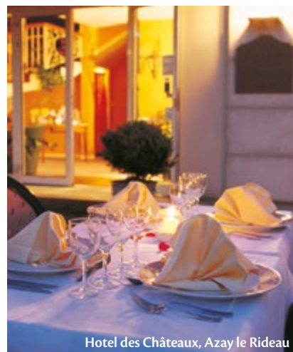
Hotel des Châteaux, Azay le Rideau

Tours - (25k) is the largest city in the region, known for its wines as well as reputedly where the most perfect French is spoken. One of the best places to head for is Place Plumereau in the old quarter. This lovely old square has pavement cafés, half timbered houses, cobbled streets and the Gothic cathedral and Basilica are not far away.