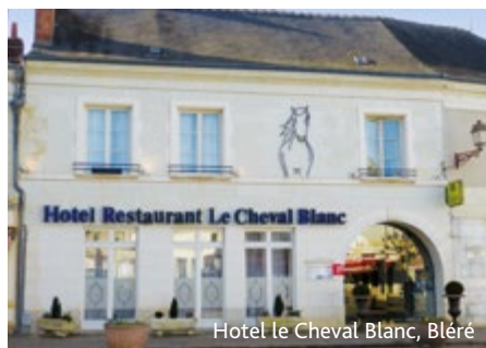
Hotel le Cheval Blanc, Bléré

Here we give some ideas of places to see in and around each of your overnight stops with an approximate distance and journey time, although please note these are just a rough guide based on fairly direct routes without any diversions or detours.