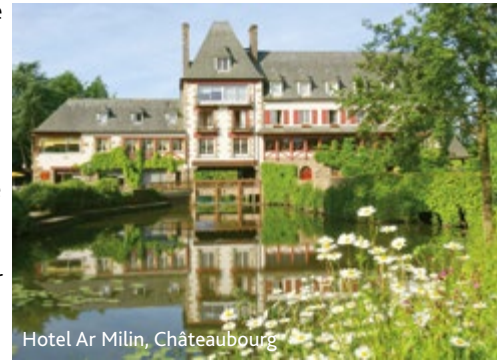
Hotel Ar Milin, Châteaubourg

Fougères - (37k) has an impressive 11thC castle which is one of the oldest in Europe. The town itself which sits on the border of Brittany and Normandy has a lovely medieval quarter to visit.