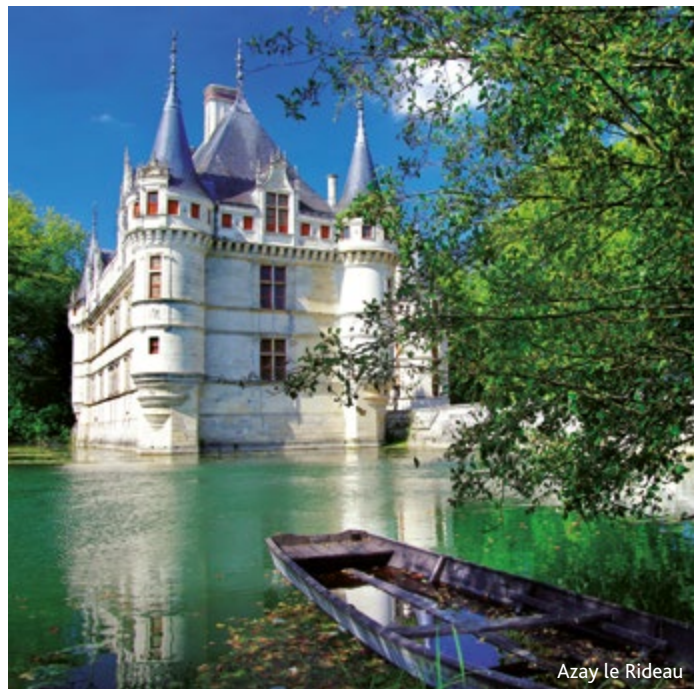
Azay le Rideau

Choose from the 3-course Menu 3 Plats at Hotel des Châteaux